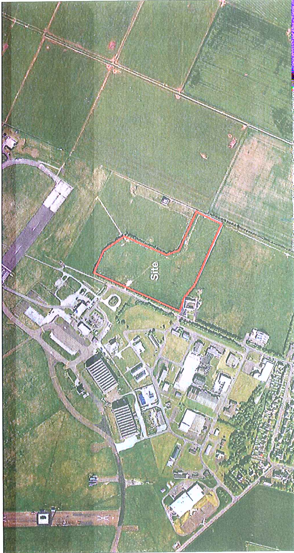
Satellite Image of Wick Coastline NNA Site boundary highlighted in red