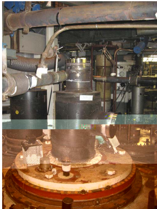
Fuel Cycle Area Decommissioning