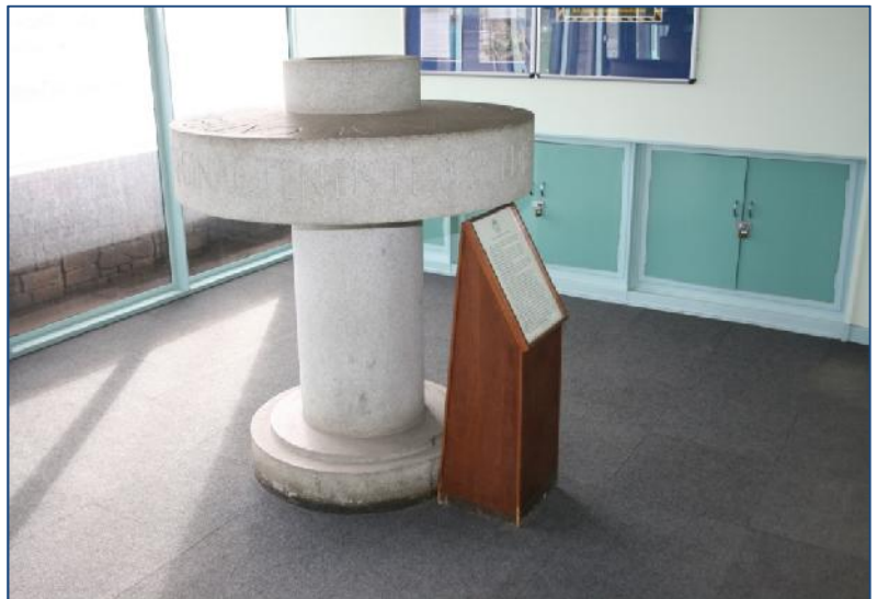
PFR stone sculpture in PFR foyer.

The PFR granite stone sculpture that is located in the PFR foyer is being donated to the NDA Nuclear Archive in Wick and plans for its removal have started. It weighs approximately 1.5 tonnes.