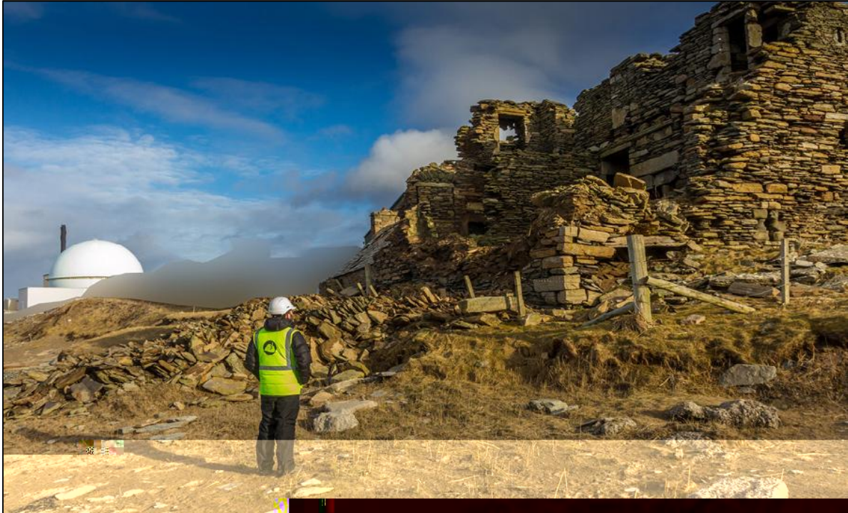
Dounreay Castle after the North wall collapse.

Dounreay Castle is a scheduled ancient monument and its north wall collapsed during a storm in February 2015. A specialist contractor inspected the castle and produced a report detailing costed options for repairs. The best way forward is under review and there will be discussion with Historic Environment Scotland.