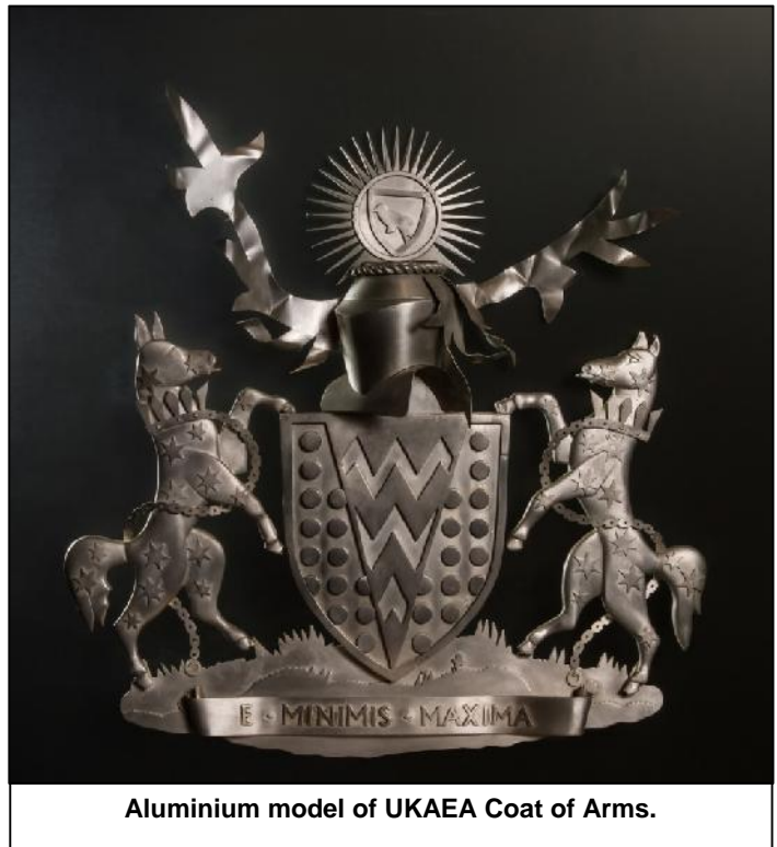
Aluminium model of UKAEA Coat of Arms.

A glass display cabinet with integral lighting was purchased and heritage objects which have not yet been donated are now on display in the Communications room located in Dounreay's Welcome Break restaurant.