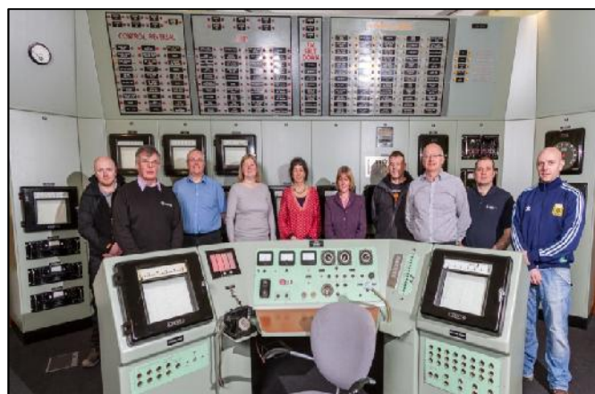
DMTR Control Room in Caithness Horizons with museum staff and DSRL installation team.

The Dounreay Materials Test Reactor (DMTR) is included in