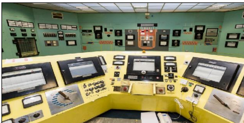
DFR Control Room just prior to being removed and placed in ISO