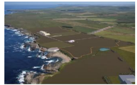
Artist impression of the Interim End State

) A OTMKUOPI QKPI VO TGF GHFG VJ G. QVPTGC] GPF UOJGY J KEJ Y KNU QVNVNG VJ G UKGY KF G UTOGI KE ORKOPUHOT VJ G UKGY J KEJ Y KNDG TGHGEVGF KP VJ G FGEEO O KUKOPIPI RTQI TCO O GI QKPI HOTY CTF FI >J KU QND KPXOXKJULQKPVFKUEVWJUCP DGW GGP . =<6' =/: + CPF VJ G 2GCF CH 2K J NPF - QVPEK] NPPKPI +VVJ QTK] VO CI TGG KP RTKPEKNG VJ G HCKXKJUCOP CHC \OPONELUWVG CHVJ G UKG KP OF XCEPG CHVJ G KPVGTG GPF ROKPFI