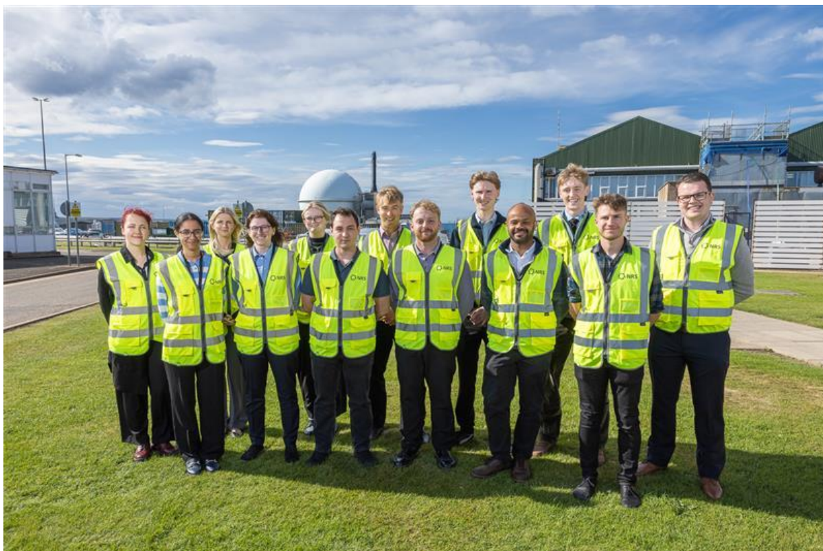
2025 intake of Dounreay graduates.