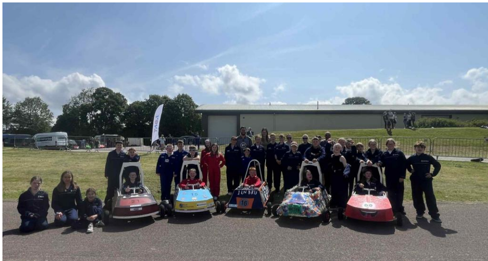
1 Caithness Pupils at Goblin Car Finals

Initial email has been sent to schools asking for interest in the 2025/26 First Lego League Challenge. NRS Dounreay supports schools participating from Caithness and North Sutherland, and hosts the North Highland Tournament in partnership with DYW North Highland and UHI North West and Hebrides.