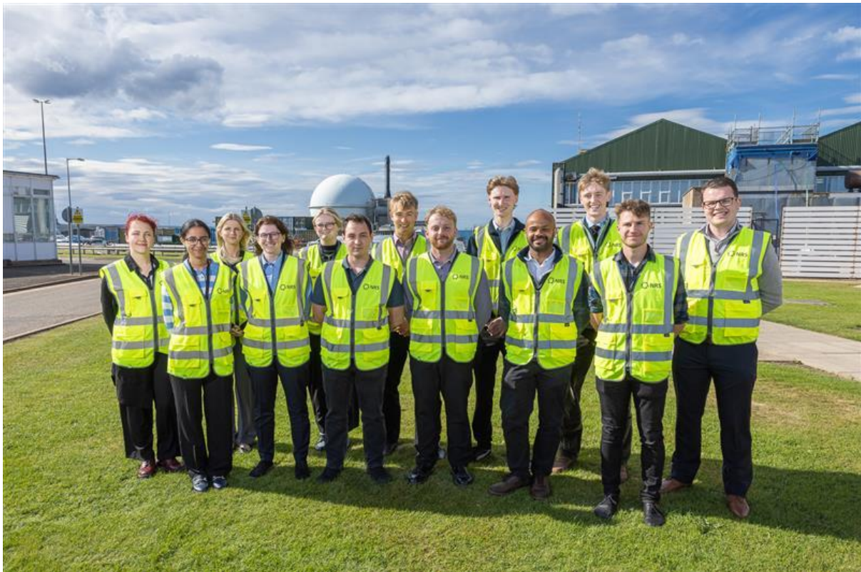
2025 intake of Dounreay graduates.

Dounreay welcomed the 2025 cohort of apprentices and graduates, with NDA Energus graduates due to start in early October.